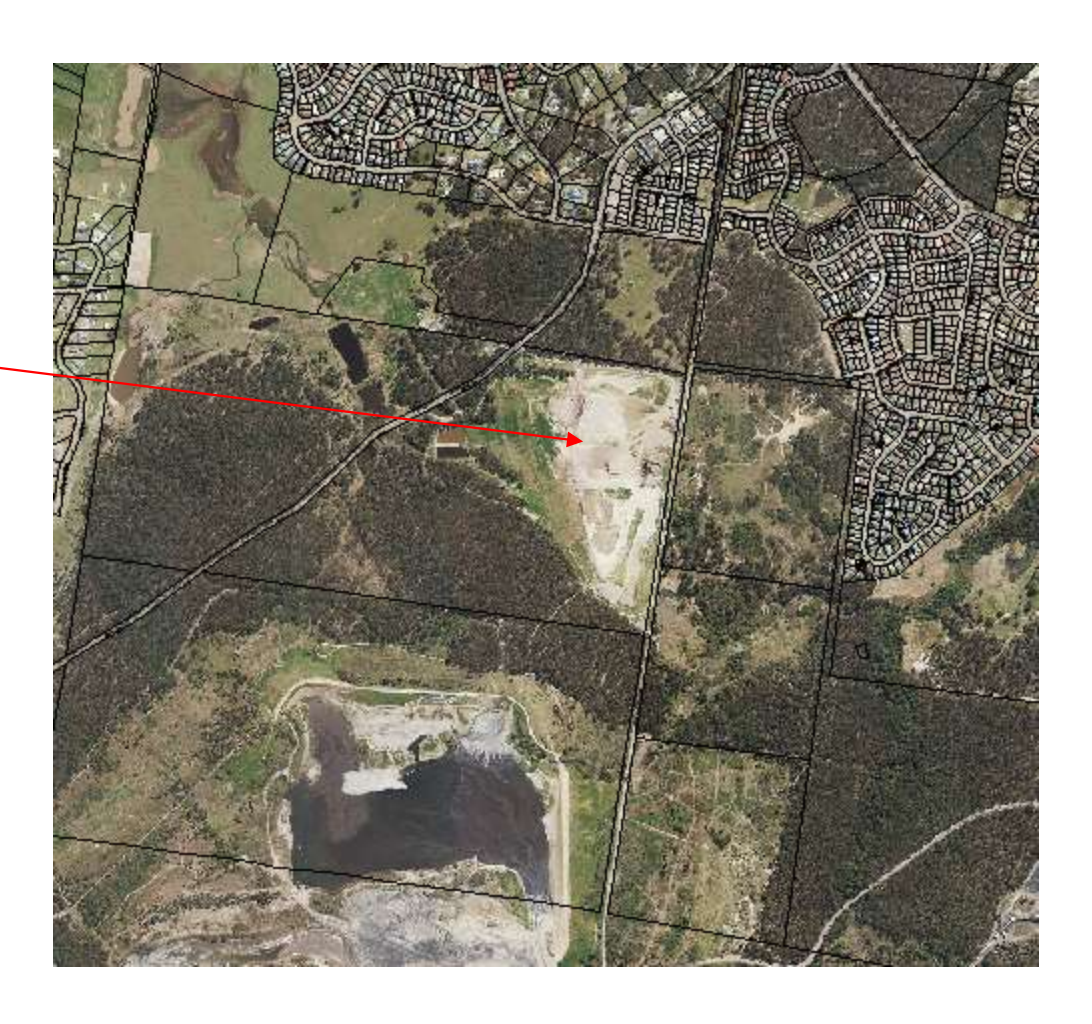
MVWMC Pollution Incident Response Management Plan 2022 Page 11 of 17

Mount Vincent Rd Waste Management Centre