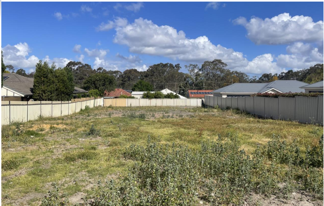
Figure 4 – Photo of existing site at 56 Brunswick Street East Maitland