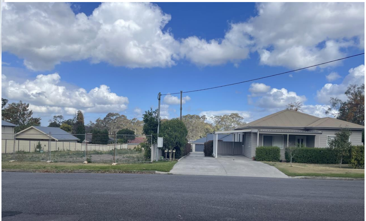
Figure 7 – Photo of 56 Brunswick Street and 58/58A Brunswick Street East Maitland