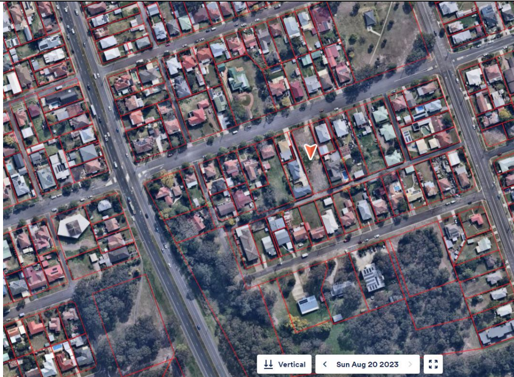
Figure 1 – Aerial view of the site