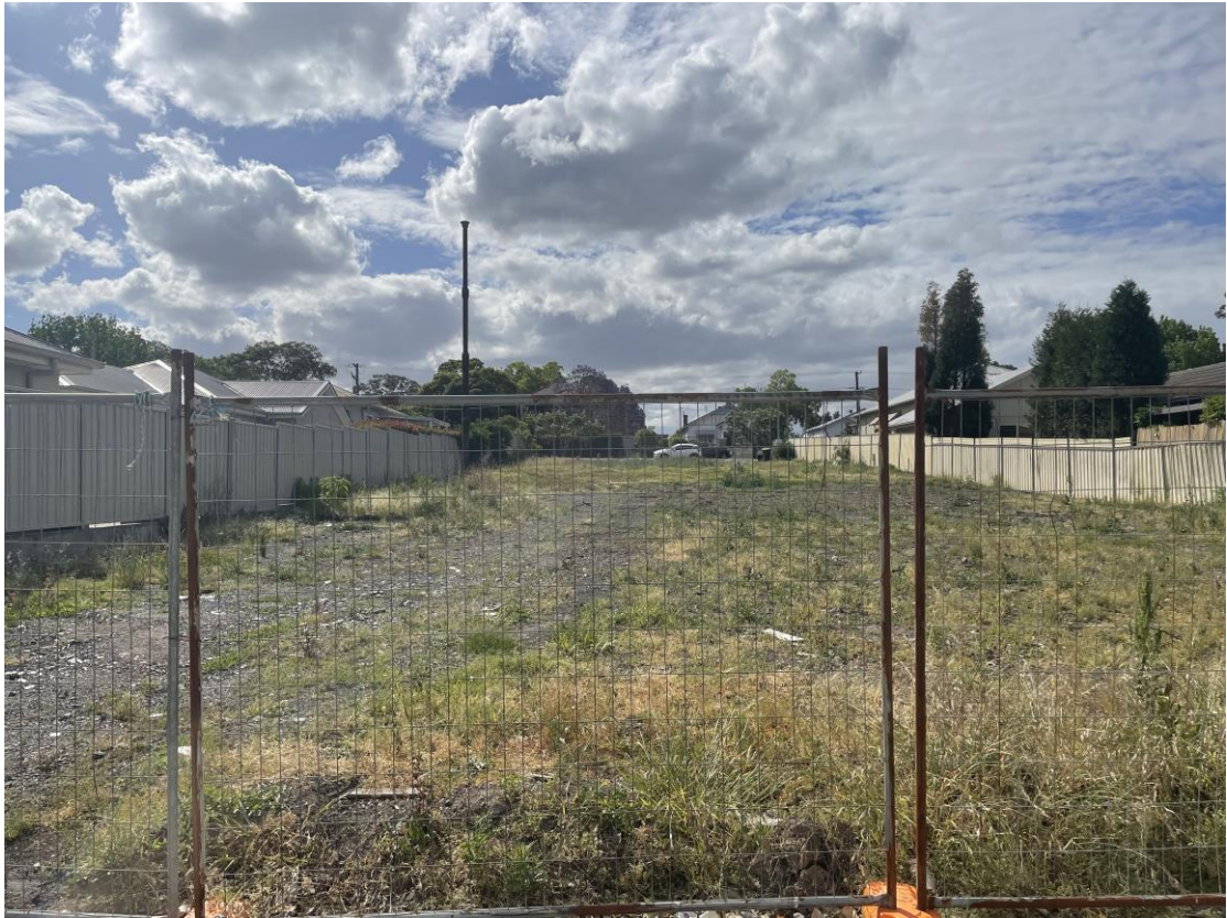
Figure 6 – Photo from rear lane of existing site at 56 Brunswick Street East Maitland