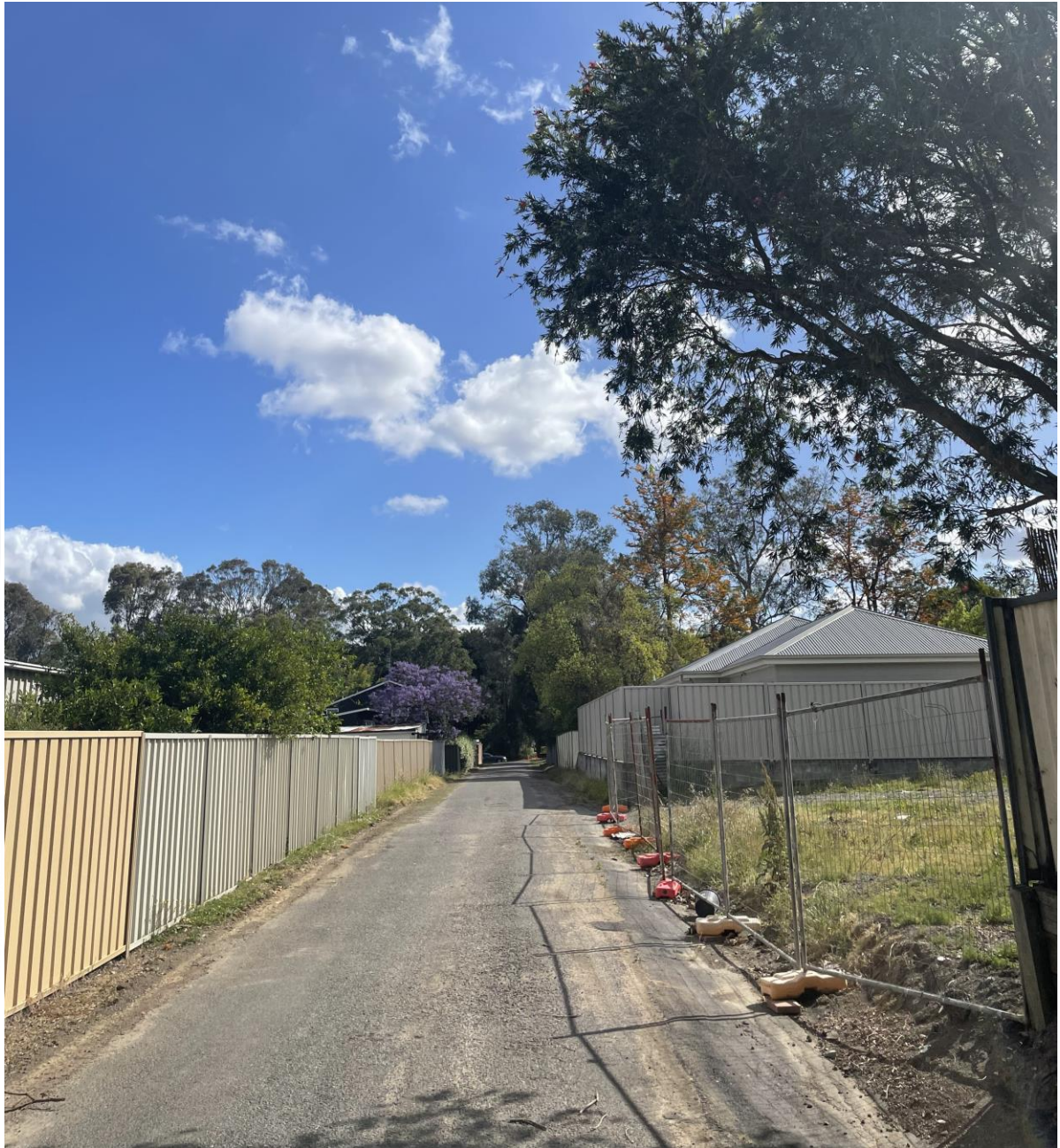
Figure 5 – Photo of existing lane at rear of 56 Brunswick Street East Maitland