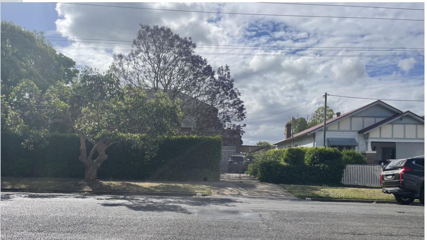
Figure 9 – Photo of house opposite the site at 53 Brunswick Street East Maitland