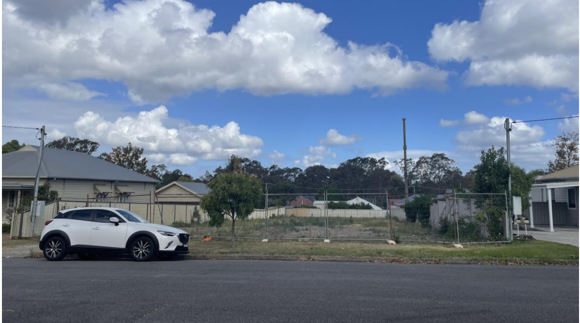
Figure 3 – Photo of existing site at 56 Brunswick Street East Maitland

The character of the area is identified as a residential area with a mixture of density types and lifestyle choices with an increasing level of medium density housing being constructed. Units are located directly next door to this property. A lane is located at the rear of the site. Adjoining land is zoned for residential purposes.