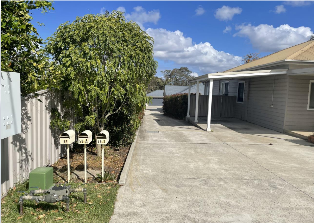
Figure 10 – Photo of 58 and 58A Brunswick Street East Maitland