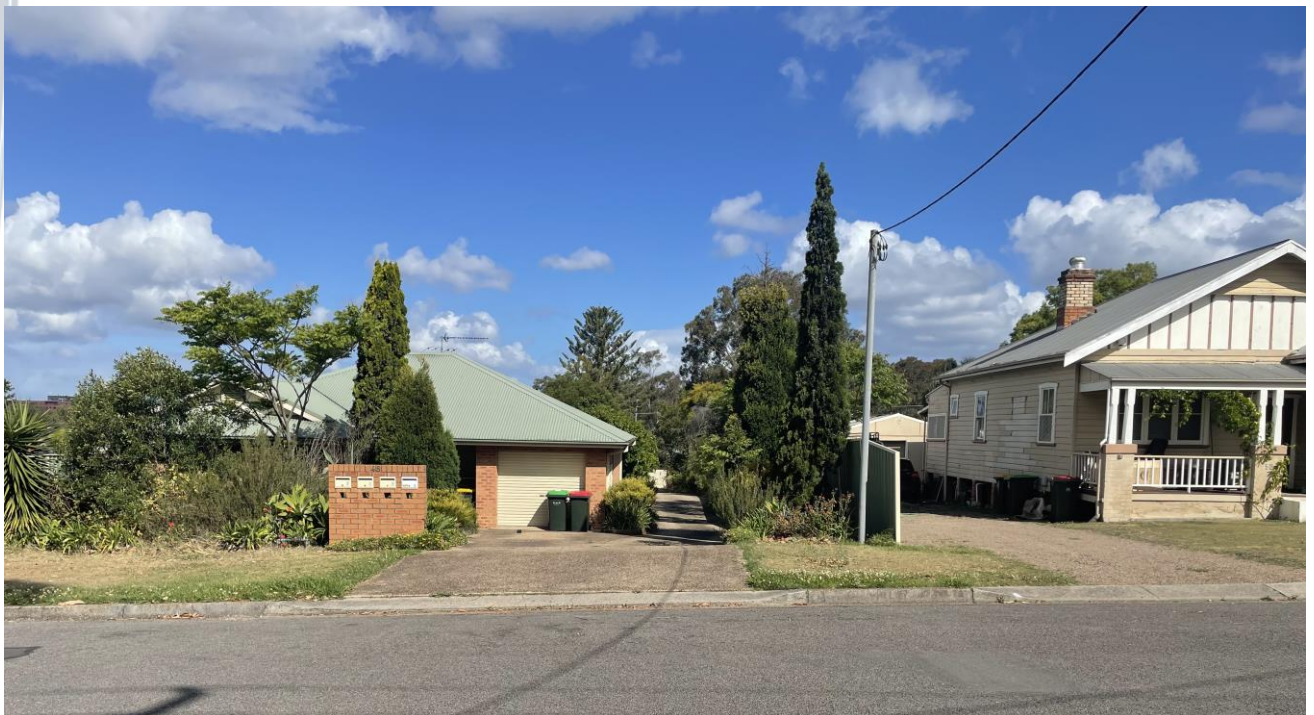
Figure 11 – Photo of existing units on Brunswick Street East Maitland