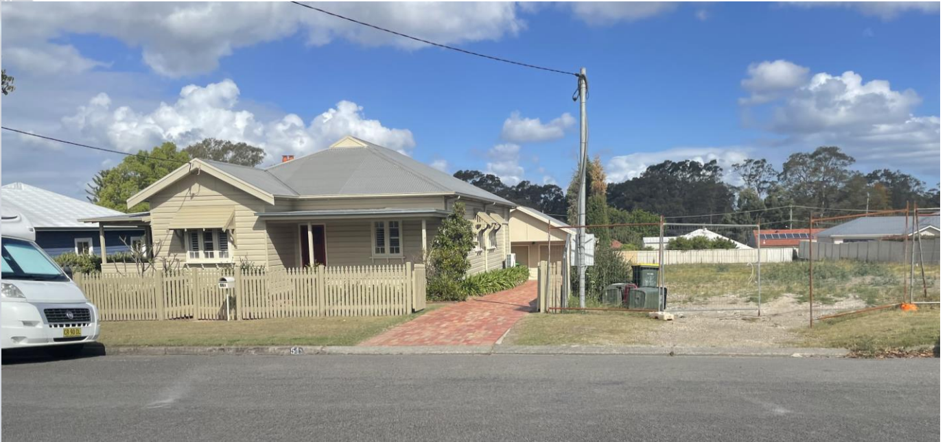
Figure 8 – Photo of 56 Brunswick Street and 54/54A Brunswick Street East Maitland