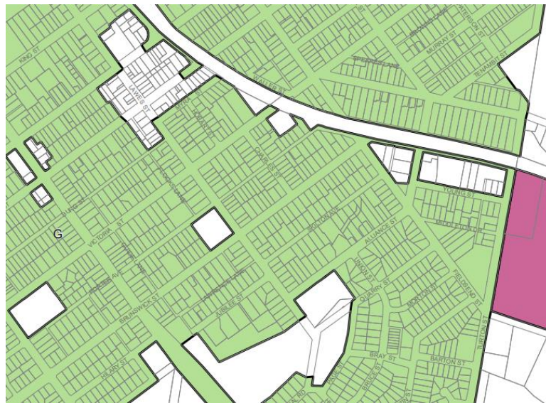
Figure 13 – Lot Size Map

The lot size map shows the minimum lot size for the site to be 450m 2 in size. The proposal includes the Torrens Title Subdivision of one (1) lot into two (2) lots. The lots are proposed to be 300m 2 and 1145m 2 in size.