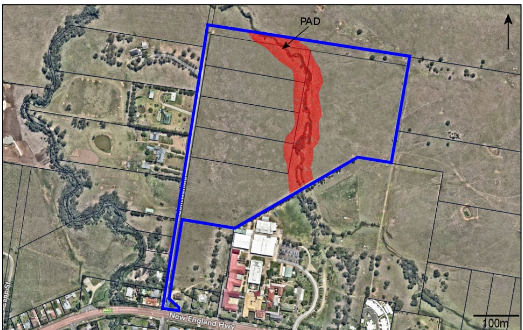
Figure 1 Location and extent of the previously identified PAD

An additional ACHA was undertaken for the WWPS and associated water and sewer infrastructure that recommended test excavation of the PAD. MCH was engaged to undertake an archaeological test excavation along part of the previously identified PAD within the project area (Figure 1) for the associated WWPS and associated water and sewer infrastructure. The test excavation included the excavation of thirty test pits (Figure 2).