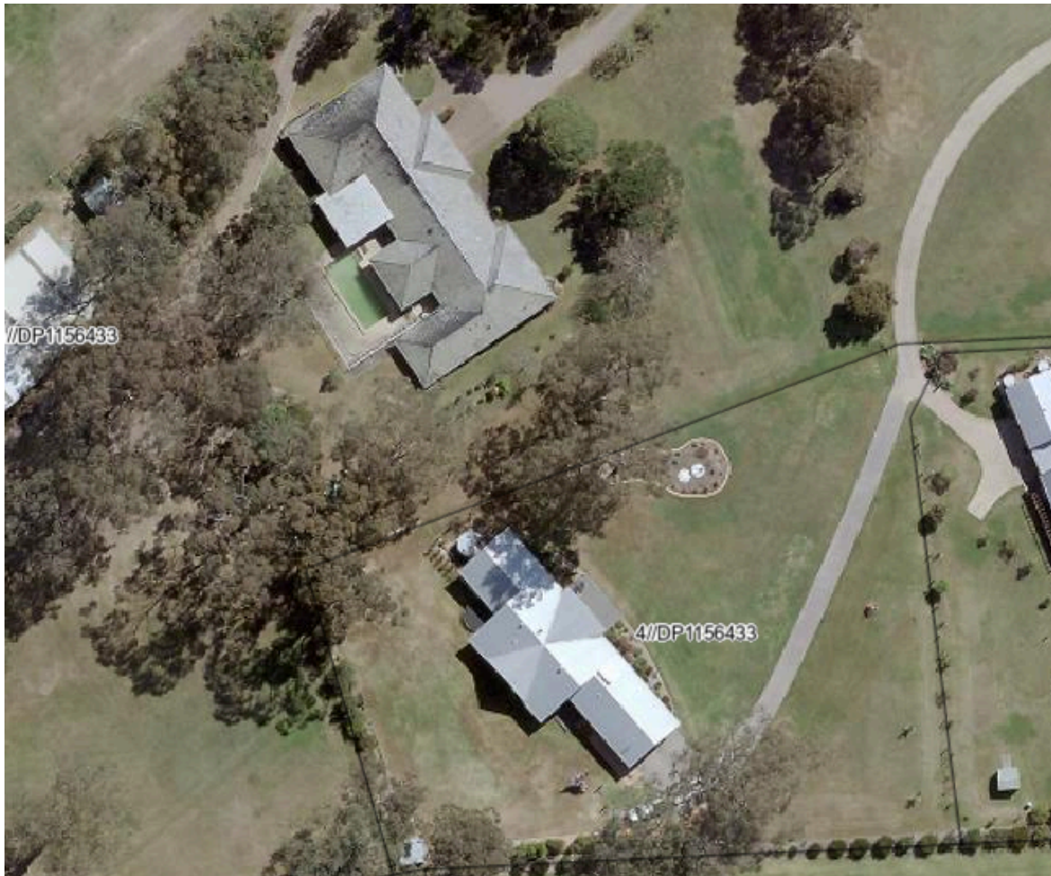
Figure 2 – Existing dwellings within Proposed Lot 9 and Lot 4 DP 1156433