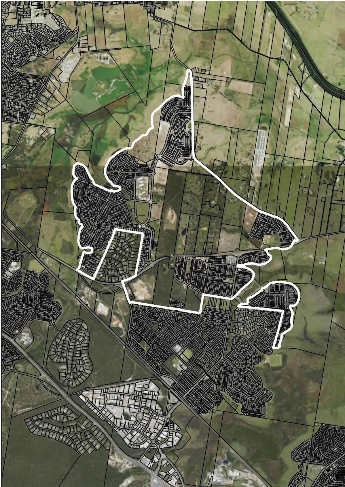
Map 1: Thornton North Contributions Catchment

This Contributions Plan applies to all land within the Thornton North release area as illustrated in Map 1.