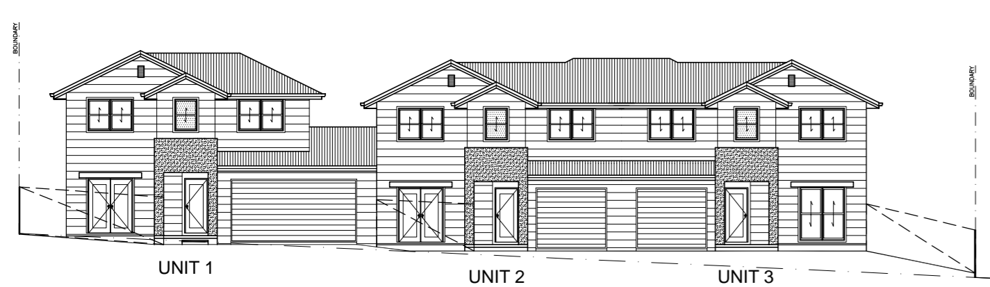
DRIVEWAY ELEVATION - WEST UNITS 1-3 SCALE 1:200