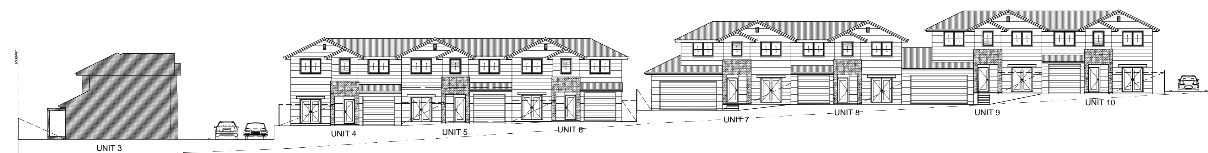
DRIVEWAY ELEVATION - NORTH UNITS 3, 4-6, 7-10 SCALE 1:200