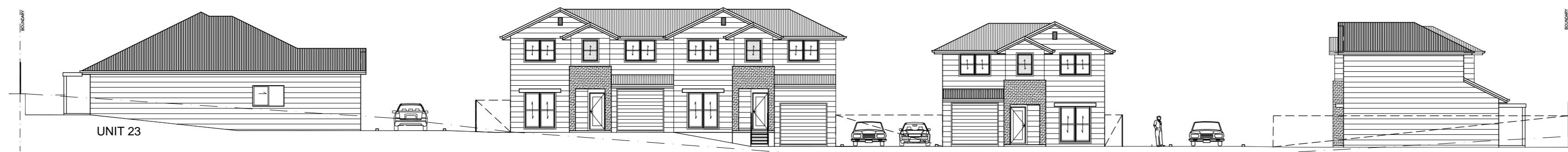
DRIVEWAY ELEVATION - WEST UNITS 10, 21-22, 23 SCALE 1:200