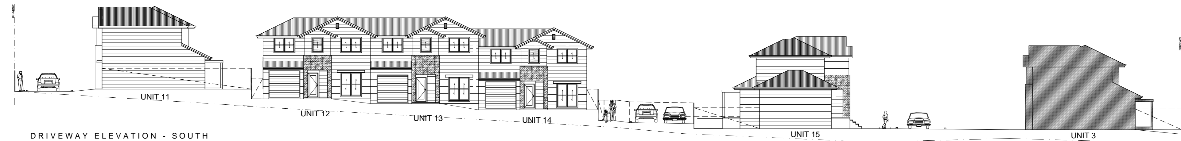
DRIVEWAY ELEVATION - SOUTH UNITS 11, 12-15, 3 SCALE 1:200