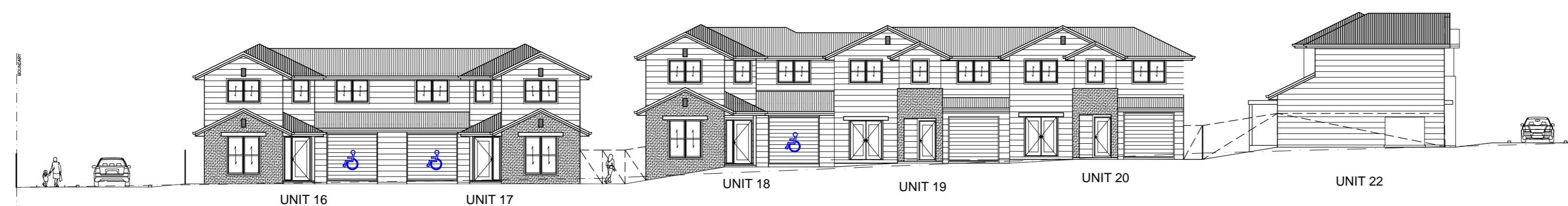
DRIVEWAY ELEVATION - NORTH UNITS 16-17, 18-20, 22 SCALE 1:200