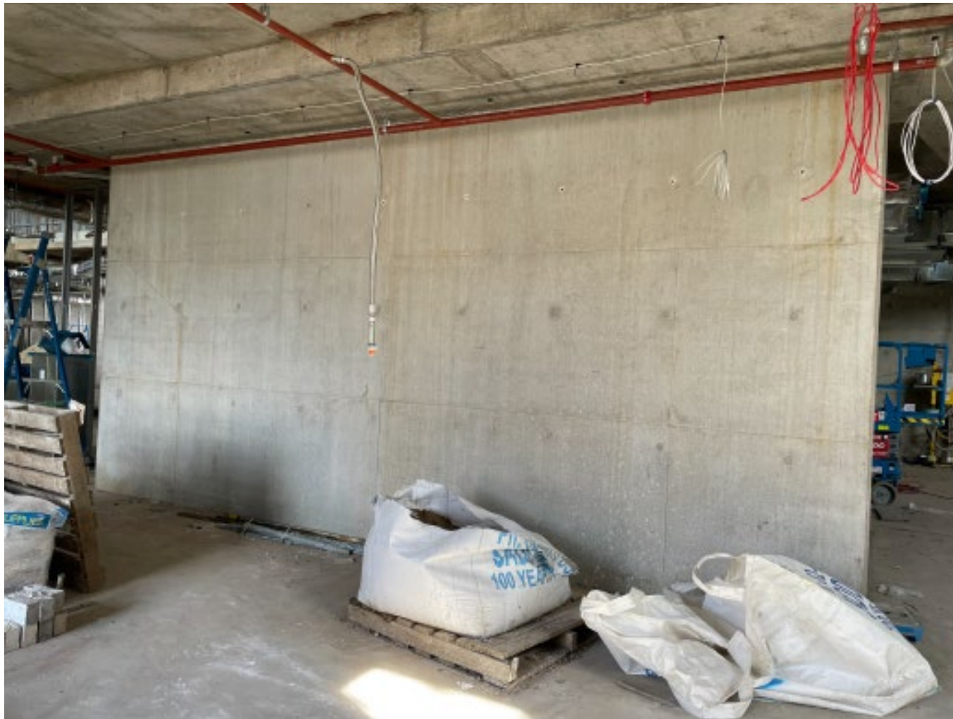
Foyer Entrance Foyer entrance wall-under construction Location of proposed artwork